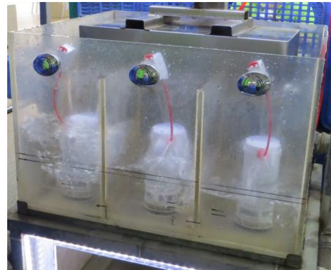
Flush volume consistency test (100% testing)