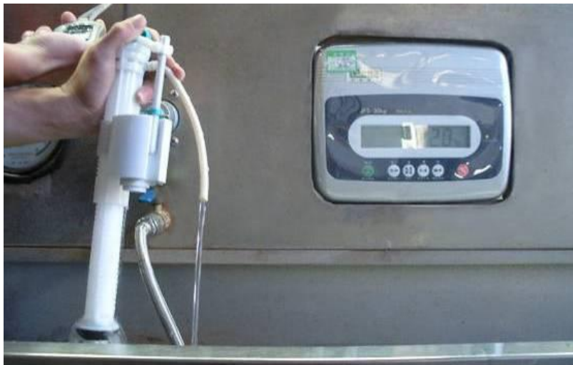
Fill valve flow volume test (100% testing)